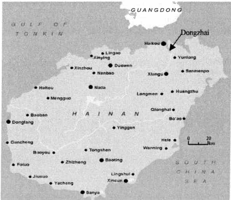
Figure 2. Location of Dongzhai 2

Located in northeastern Hainan within the subtropical zone, it comprises an estuary with inter-tidal sand and mudflats and a mangrove forest zone. The land area of the reserve covers approximately 3,337.6 ha; the open water area, 2,062.4 ha at low tide. Ninety percent of the total number of mangrove species recorded in China has been found here. As well, it is one of the most important stopover sites between Japan and Australia for migrating water birds (Wetlands International, 1999).