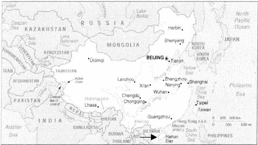
Figure 1. Location of Hainan, China 1